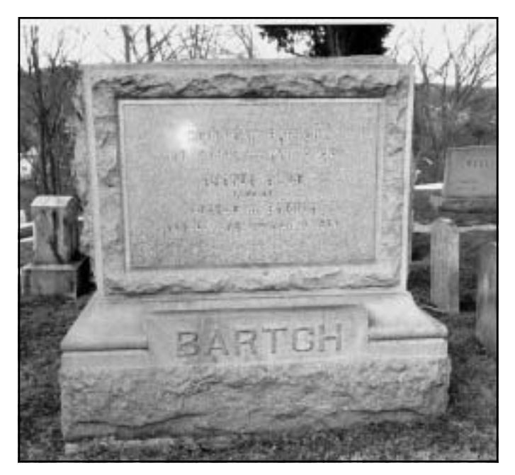
Bartch Family grave site in the Old Rosemont Cemetery, Bloomsburg, Pennsylvania

through Old Rosemont Cemetery and let your eyes scan the numerous tombstones, you are looking at names that once had a connection to our community. The name on a grave marker is a title to a life story.